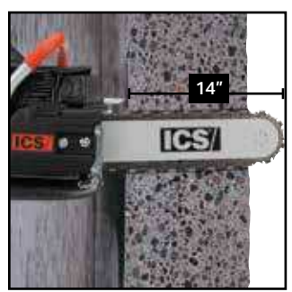
Deep cutting solution for obstructed or small openings