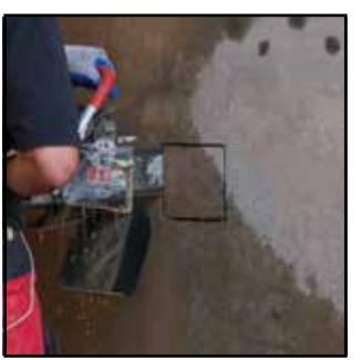
Cut squares as small as 4" x 4" (10 cm x 10 cm)