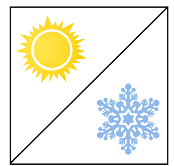
Easy-to-start in all weather