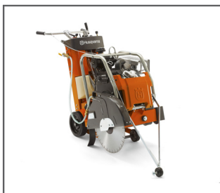
SELF-PROPELLED For easy operation and comfort.

Our convenient FS 524 is a powerful, yet compact, self-propelled petrol floor saw ideal for asphalt and concrete cutting. Suitable for small to medium-sized service and repair jobs, up to 241 mm cutting depth. The optimal power transmission makes it ideal for more demanding jobs, despite its compact size. User-friendly and developed with a clear focus on your comfort.