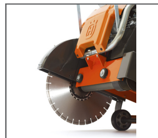
LOW VIBRATIONS Engine and blade shaft mounting system increases comfort and gives excellent cutting performance.