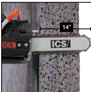
Deep cutting solution for obstructed or small openings

Extended drive sprocket adapter offers easy chain assembly