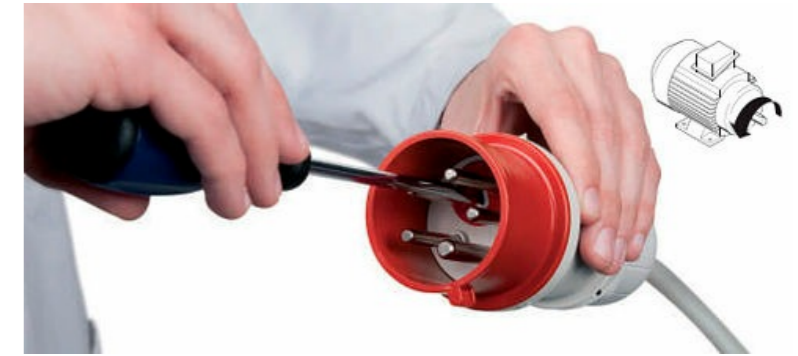
PHASE INVERTER PLUG FITTED